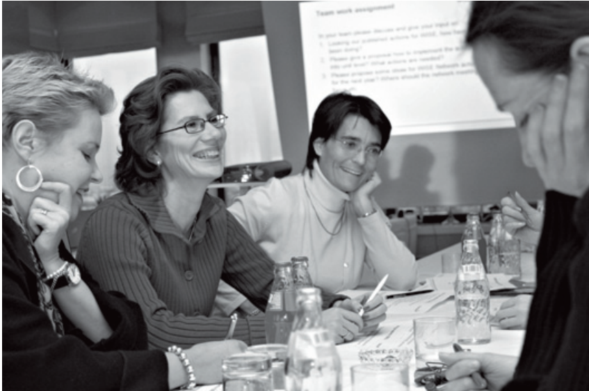
The network for Women in Stora Enso (WISE) had its first meeting in January 2004. One of the most important tasks of the network is to follow up how the WISE action plan has been realised.

Diversity at Stora Enso is seen as one tool among others to foster better management. Stora Enso's senior management is responsible for fostering and supporting diversity in the Group as whole, with divisional and unit management responsible for diversity at the local level. However, addressing diversity issues in everyday work is everyone's responsibility. For two years gender has been a priority area in Stora Enso's diversity work.